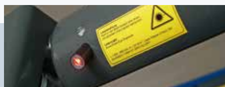
... or, optionally, by using the laser pointer.