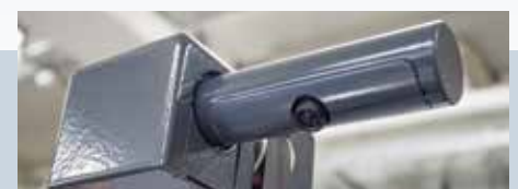
If a positioning camera has been installed, the distinctive features of the car's bodywork can be used to align the MLT 3000 very precisely. The guide grid on the colour screen assists with assessment.