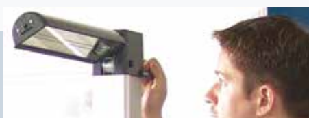
The unit is aligned with the vehicle by means of a mirror...